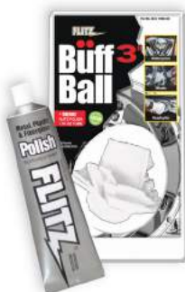
Item: MINI 10180-50