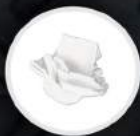
Mini 3" BuffBall