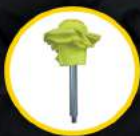
Super Mini BuffBall